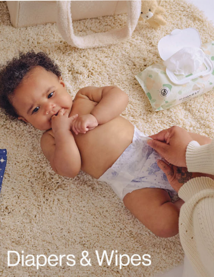
Diapers & Wipes