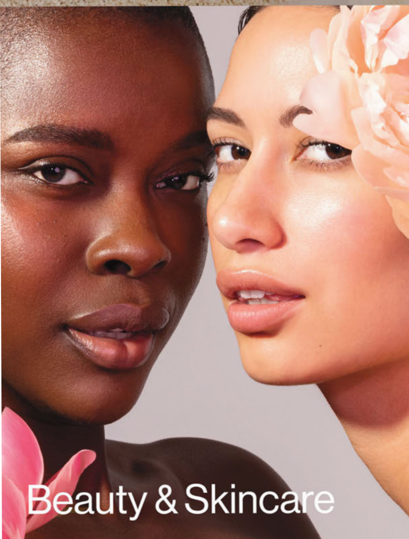
Beauty & Skincare